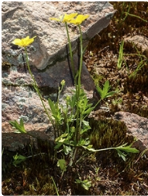
Flowering plant.