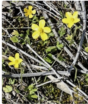
Flowering plants.