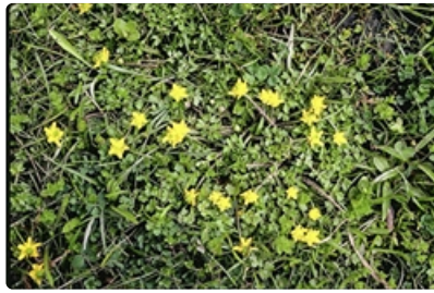
Plants. Australian Plant Image Index, photographer Murray Fagg, Namadji National Park, ACT