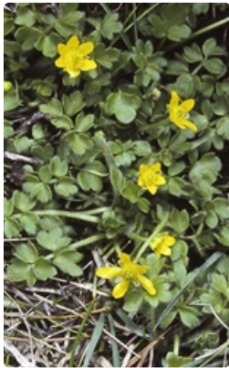
Flowers and leaves. Photographer Don Wood, SE Forests National Park