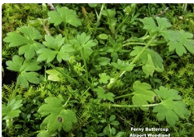
Plant. Photographer Richard Hartland, unknown site