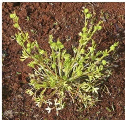
Flowering plant. Scotia Sanctuary, western NSW