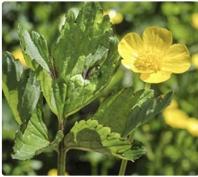
Flower and leaf. Australian Plant Image Index, photographer Murray Fagg, Adelong to Tumut