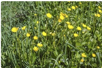
Flowering plants. Adelong to Tumut