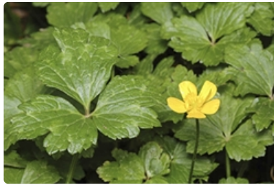
Flower and leaves. Australian Plant Image Index, photographer Murray Fagg, Jerrabomberra Wetlands, ACT