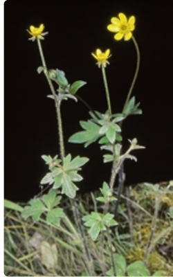
Flowering plants. Photographer Don Wood, Blundells Creek Road, ACT