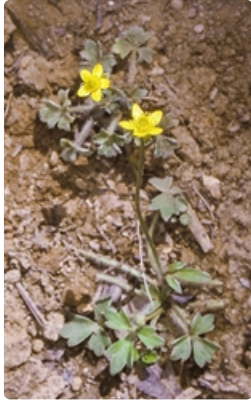
Flowering plants. Wadbilliga National Park