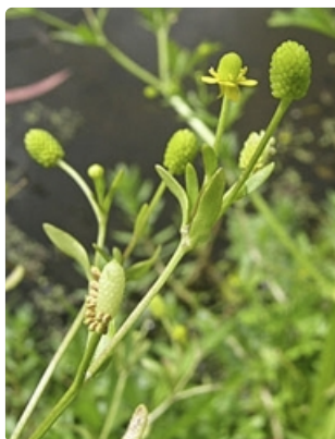
Flowering and seeding stems. Australian Plant Image Index, photographer RCH Shepherd, Somers, Vic