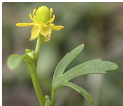
Flower and leaves.