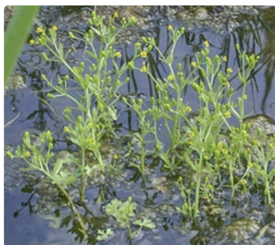
Plants.