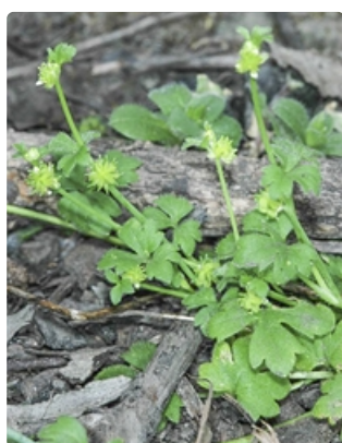
Flowering and seeding stems (var. sessiliflorus ). Photographer Chris Lindorff, west of Melbourne, Vic