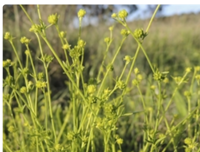
Flowering and seeding plants (var. sessiliflorus ).