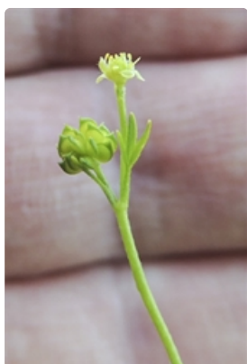
Stem with flower and young seeds (var. sessiliflorus ).