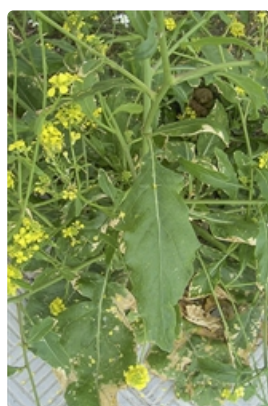
Leafy stem.