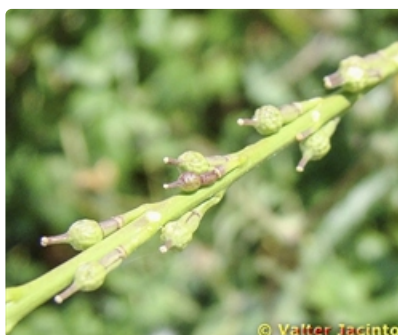
Seed cases.