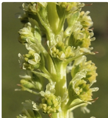
Flowers. Australian Plant Image Index, photographer Greg Jordan, Tas