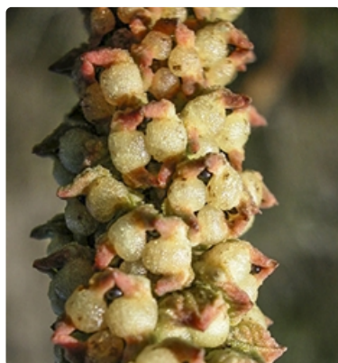
Seed cases.