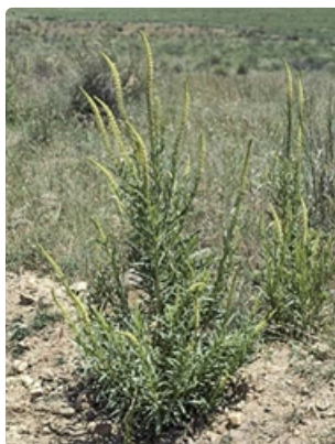
Plant. Australian Plant Image Index, photographer Murray Fagg, near Adaminaby