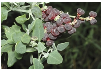
Fruting stems. Lachlan Valley National Park,