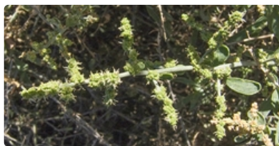
Female flowers and leaves. Photographer Don Wood, Scotia Sanctuary, western NSW