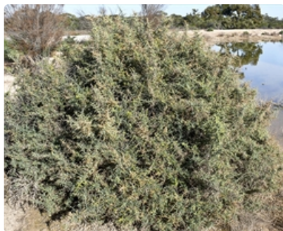
Shrub. Scotia Sanctuary, western NSW