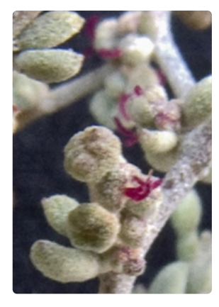
Female flowers and leaves. Scotia Sanctuary, western NSW