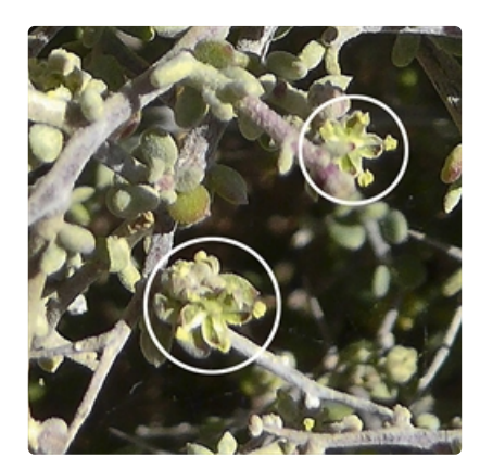
Male flowers and leaves. Scotia Sanctuary, western NSW