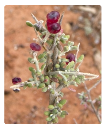
Fruit and leaves. Gluepot Reserve, SA