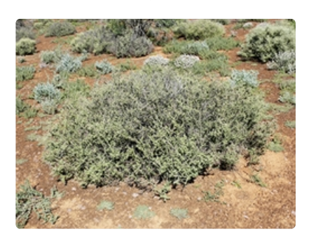
Shrub. Scotia Sanctuary, western NSW