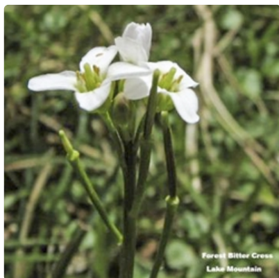
Flowers and young 'pods'. Lake Mountain, Vic