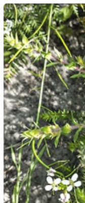
Flowering and seeding stem. Grampians National Park, Vic