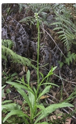
Flowering plant.