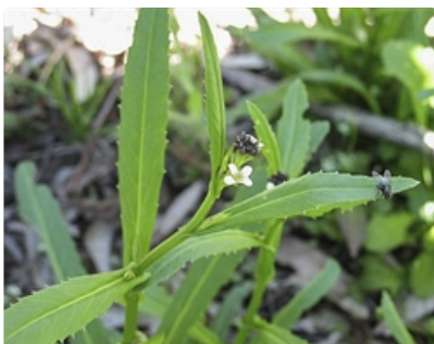
Flowering stem with young seed cases.