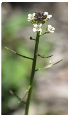
Flowering stem with 'pods'.