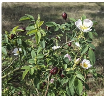
Flowering branches.