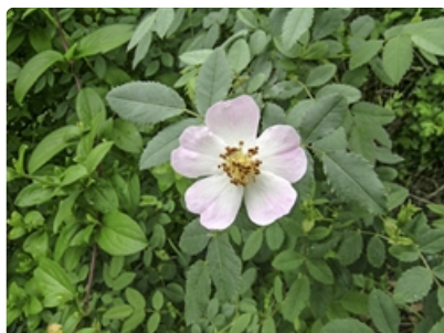
Flower and leaves. Australian Plant Image Index, photographer ROH Shepherd, Mt Eliza, Vic.