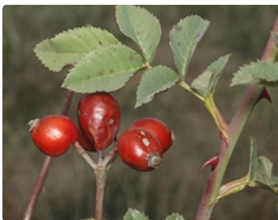
Fruit and leaf. Jerrabomberra Wetlands, ACT