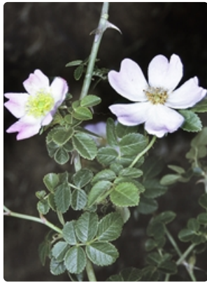
Flowering stems. between Mbruya and Araluen