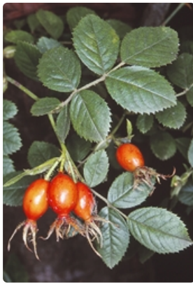
Fruit and leaves. SW of Nerriga