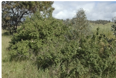
Shrub.