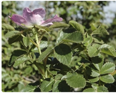
Flower and leaves.