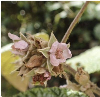
Flowering stem.