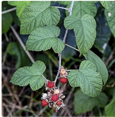
Fruiting stem. near Merimbula