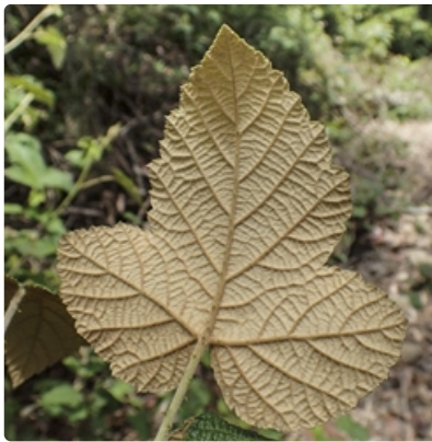
Back of leaf.