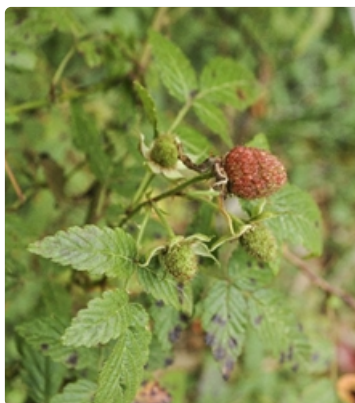
Fruit and leaves.