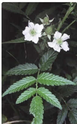
Flowering stem. west of Nowra