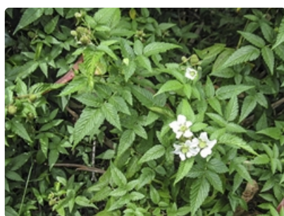
Flowers and leaves.