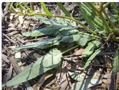
Leaves. Australian Plant Image Index, photographer Alexander Schmidt-Lebuhn, Illunie Nature Reserve south of Cowra http://plantnet.rbgsyd.nsw.gov.au/cgi-bin/NSWfl.pl?page=nswfl&lvl=sp&name=Populus-nigra-cv.+:qu;Italica;qu;