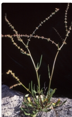
Plant. Photographer Don Wood, Mt Tennent, ACT