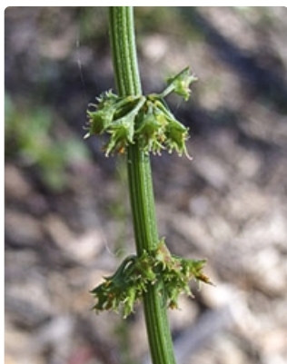
Seed cases on stem. Illunie Nature Reserve south of Cowra