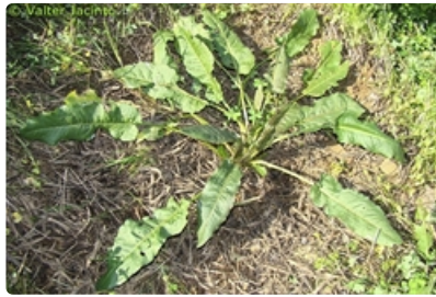
Basal rosette.