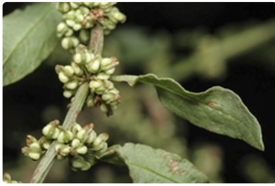
Seed cases and leaves.