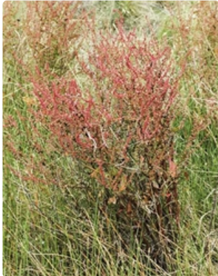
Plant. Scottsdale Bush Heritage Reserve, near Bredbo