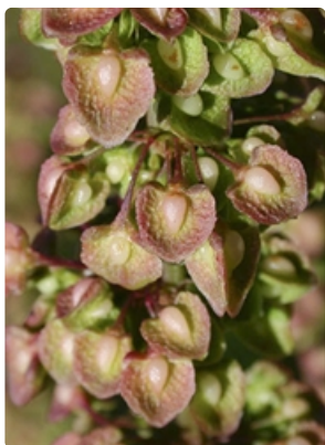
Seed cases.