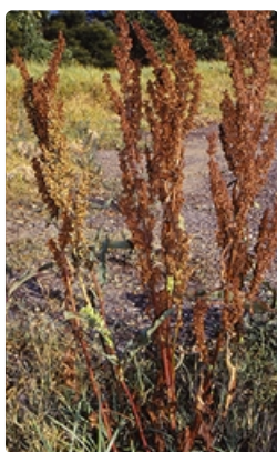
Plant. north of Milton