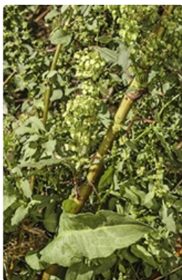
Leaf, stem, and young seed cases. near Gundaroo north of Canberra