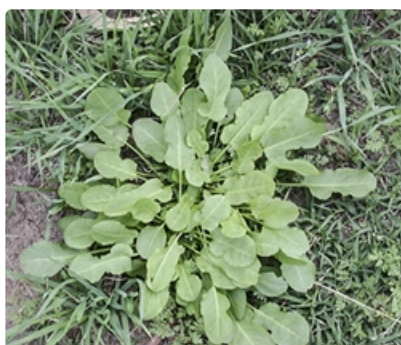
Young plant. Australian Plant Image Index, photographer RCH Shepherd, Shelford, Vic