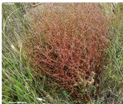
Drying plant.