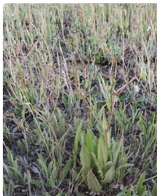
Flowering plants. Photographer Michael Bedingfield, paddock east of Murrumbidgee River, ACT