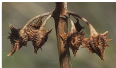
Seed cases. Photographer Russell Best, near Sunbury, Vic