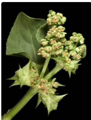
Flowering and fruiting stem.