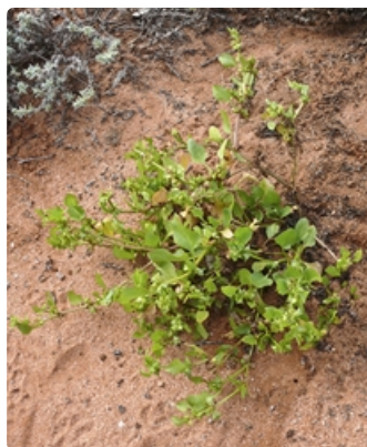
Plant. Photographer Don Wood, Scotia Sanctuary, western NSW