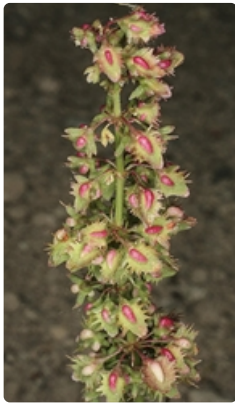
Seeding stem