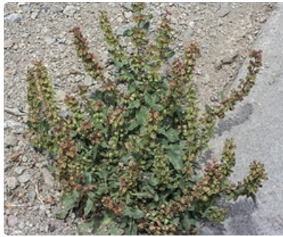
Plant. Australian Plant Image Index, Dale A. Zimmerman Herbarium, New Mexico, USA