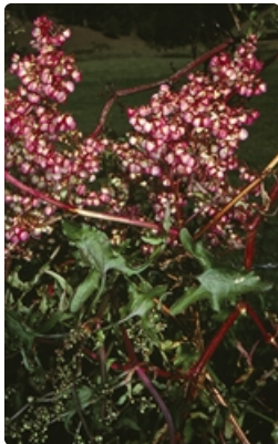
Seeding stems. Photographer Don Wood, west of Bodalla