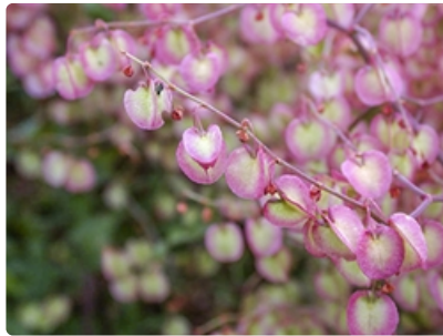
Seed cases.