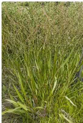
Plant. Warkworth, west of Singleton