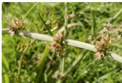
Seed cases on stem. Photographer Tony Rodd, Warkworth, west of Singleton