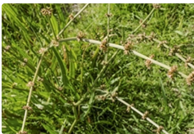
Seeding stems. Photographer Tony Rodd, Warkworth, west of Singleton