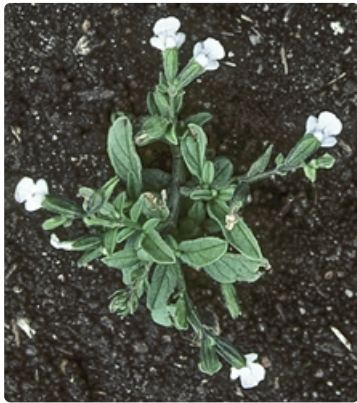
Flowering plant. Photographer Don wood, Carnarvon station Bush Heritage Reserve via Augathella, Qld