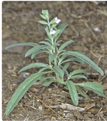
Flowering plant. Photographer Don wood, Carnarvon station Bush Heritage Reserve via Augathella, Qld