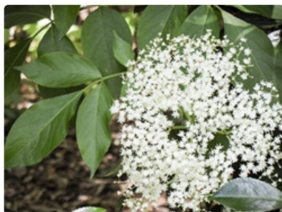
Flowers and leaves.