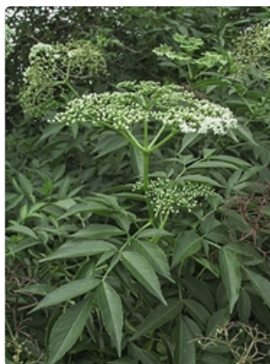
Flowering stem.