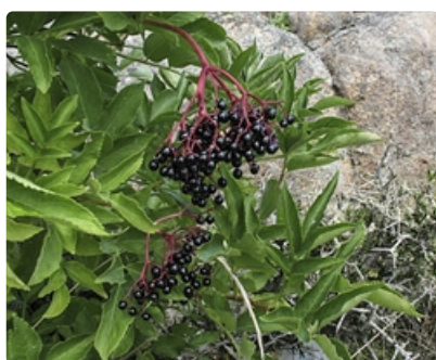
Mature fruit and leaves.