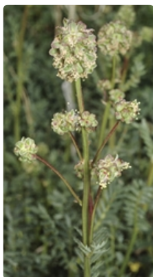
Flowering stems, showing male flowers. Australian Plant Image Index, photographer Murray Fagg, Woodstock Nature Reserve, ACT