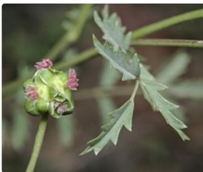
Leaflets and female flowers. Brindabella Range, ACT