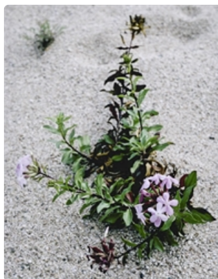
Flowering plant. near Willis, NSW