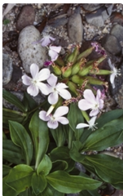
Flowering stem. Coolungubra State Forest near Bombala