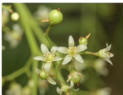
Flowers. Australian Plant Image Index, photographer Murray Fagg, Woodstock, NSW