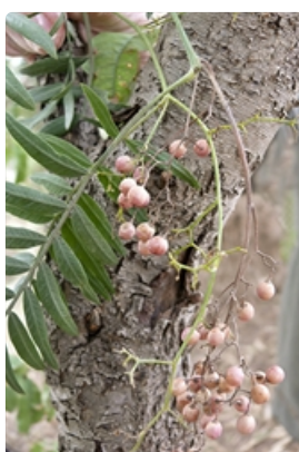
Fruiting stem and bark. Photographer Don Wood, Boundary Bend, Vic