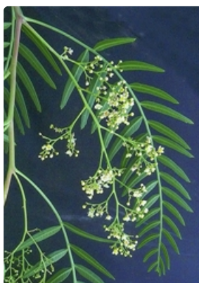
Flowering stem. Photographer Don Wood, Scotia Sanctuary, western NSW