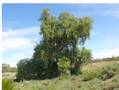
Tree. Scotia Sanctuary, western NSW