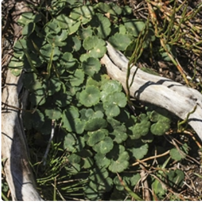
Plant. Photographer Geoff Lay, © 2021 Geoff Lay. Published in VICFLORA