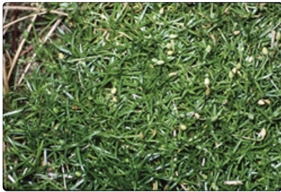
Flowering mat.