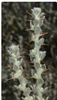
Stems with spiny seed cases. about 280 km SE of Blackall, Qld