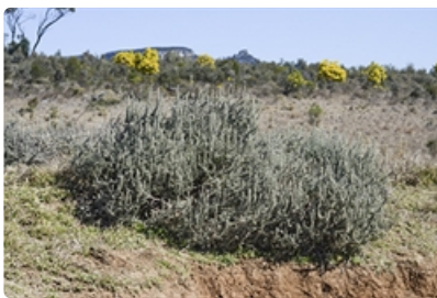
Shrub. about 280 km SE of Blackall, Qld