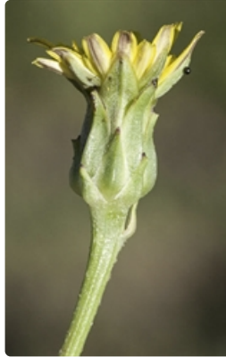
Flower head.