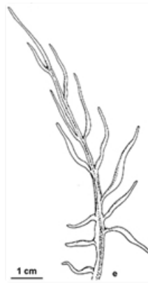
Line drawing (var. laciniata ). e. leaf. E Beckett, E., University of Oxford, © 2021 Royal Botanic Gardens Board, Melbourne, Vic