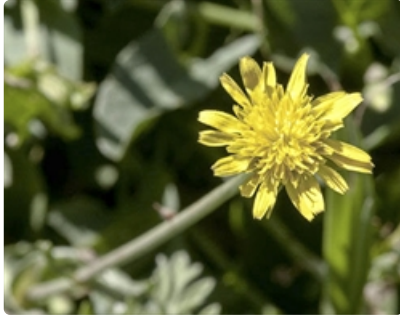
Flower head.