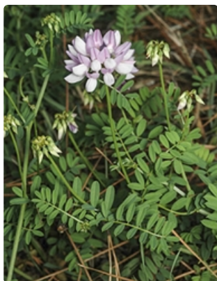
Flowers and leaves. Australian Plant Image Index, photographer Murray Fagg, Yarralumla, Canberra, ACT