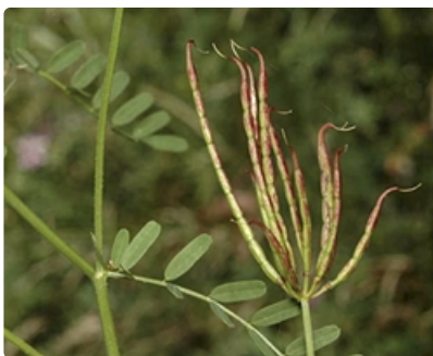
Pods and leaves. Australian Plant Image Index, photographer Murray Fagg, Black Mountain, Canberra, ACT