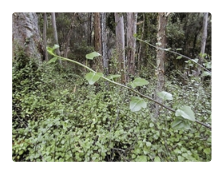
Leafy stems.