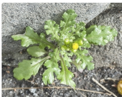
Flowering plant. Photographer Jon Sullivan, New Zealand.