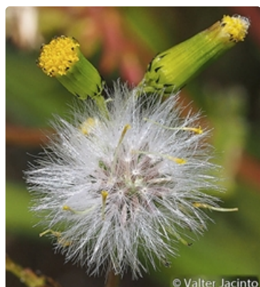
Flower heads and seeding head.