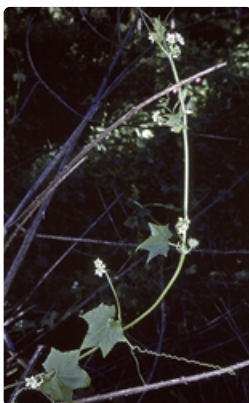
Flowering stem. Mt Gulaga near Tilba Tilba