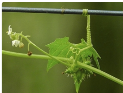
Flowering stem with young fruit.