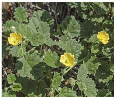
Flowers and leaves. near Cowra