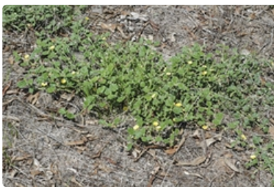
Plant. Australian Plant Image Index, photographer Murray Fagg, near Cowra