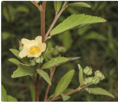
Flower, flower buds, and leaves. Jervis Bay