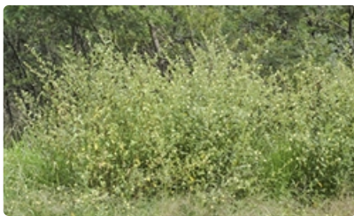
Plant. Australian Plant Image Index, photographer Murray Fagg, near Nelligen