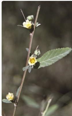
Flowering branch. north of Terrell