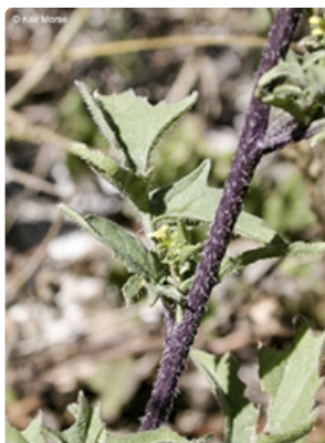
Stem and leaf. Photographer Keir Morse, Oregon, USA