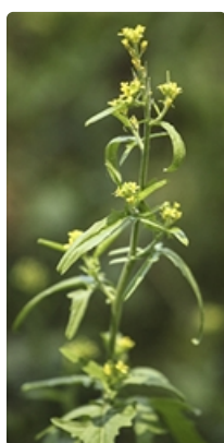
Flowering stem. unknown place