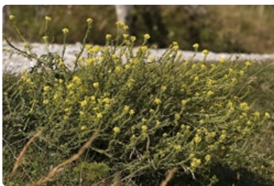
Plant. unknown place