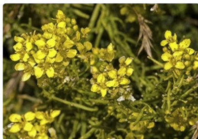
Flowers. Photographer Kurt Kulac, unknown place