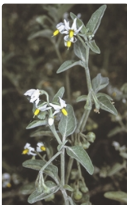
Flowering stems. Photographer Don Wood, Brogo