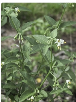
Flowering and fruiting stems.