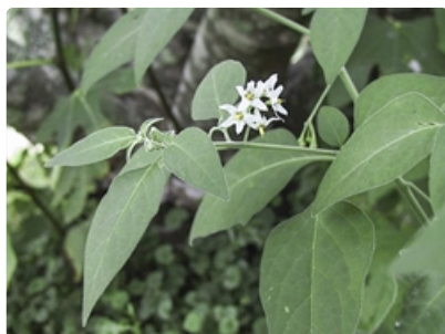
Flowering stem.