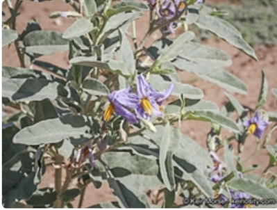
Flowers and leaves. Photographer Keir Morse, California, USA