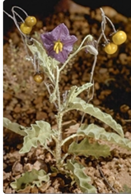
Flowering and fruiting plant.