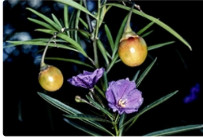
Leafy stems with flowers and ripe fruit.