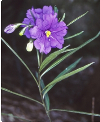
Flowering stem.