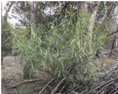
Shrub. Mt Ainslie, Canberra, ACT