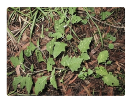
Leafy stems and flowers.