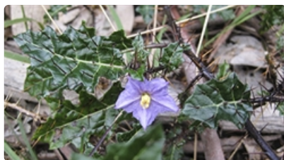
Flower and leaves.