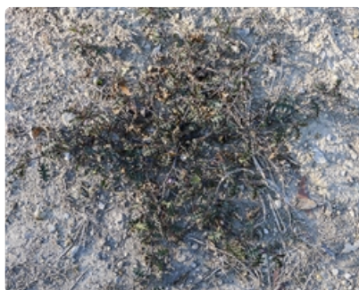
Shrub. near Kempsey