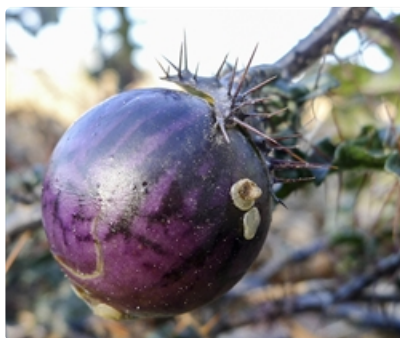
Ripe fruit. near Kempsey