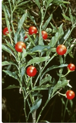
Fruiting branches. Photographer Don Wood, NW of Ulladulla