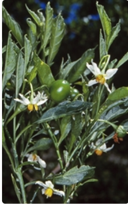
Flowering branches. Brogo north of Bega