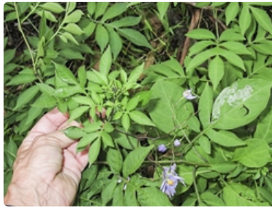
Flowers and leaves.