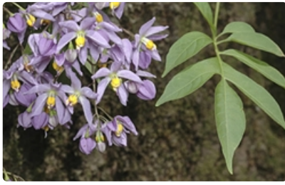
Flowers and leaf. Australian Plant Image Index, photographer Murray Fagg, Kangaroo Valley to Berry Rd