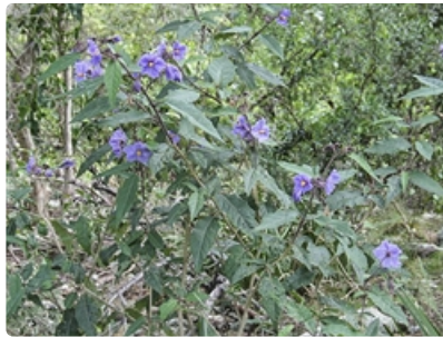
Flowering branches.