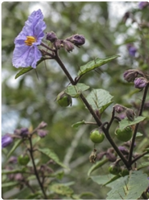
Flowering stem with young fruit.