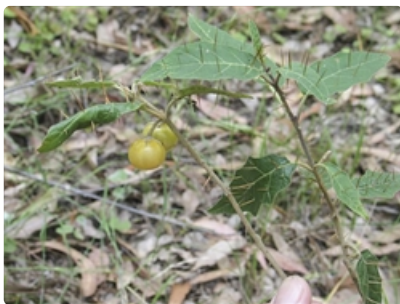
Leafy stem with ripe fruit.